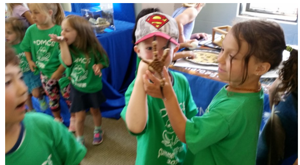
Please remember DMCS in your will.