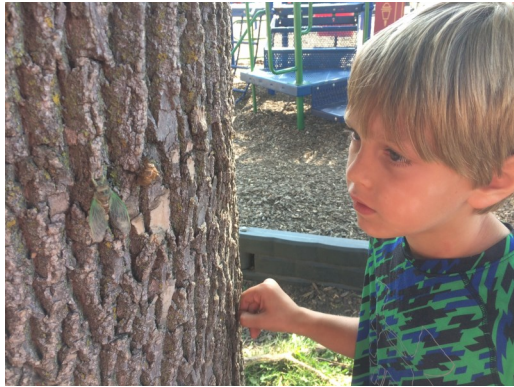
K-5 students found a cadia the playground!