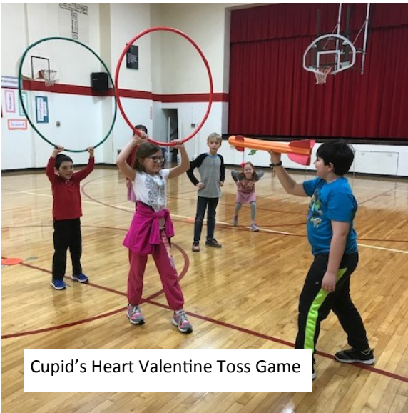
Cupid's Heart Valentine Toss Game