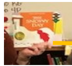
The Snowy Day By Ezra Jack Keats