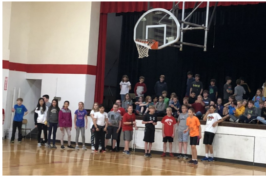
The cold and rainy weather may have put a stop to "Pool Day", but the students and staff had a great time playing Kickball in the gym.