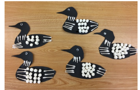
K-5 Summer Program made their own Loons to kick off the Minnesota unit they are working on this week.

Summer Care Kids show off their new field trip t-shirts! →