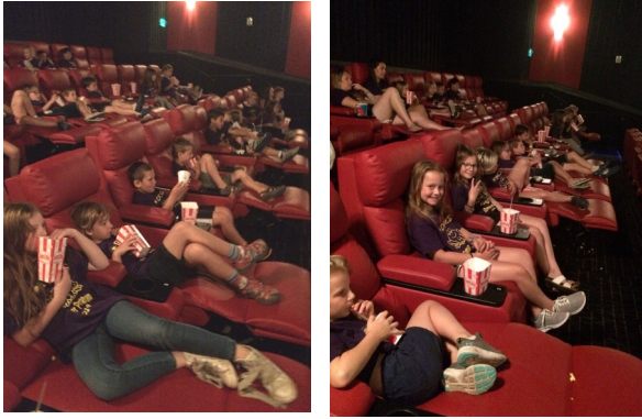
Everyone enjoyed a relaxing afternoon watching "Toy Story 4".