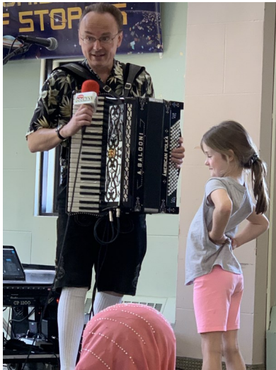
Polka Time at the library!