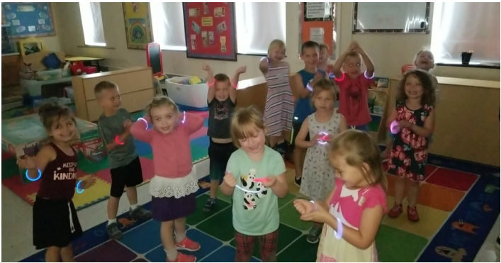
Preschoolers enjoy a “Glow in the Dark Party”!

Preschoolers were very excited to make sparklers and wear their 4th of July sunglasses to our outside dance party Tuesday morning!